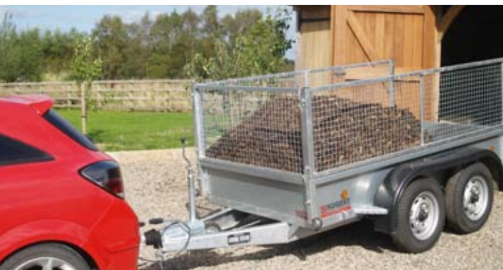
Optional aluminium threadplate floor covering.