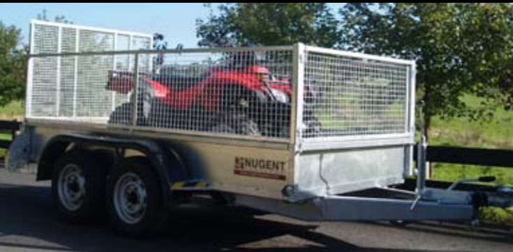
Manufactured with the Nugent Trademark for durability and strength.